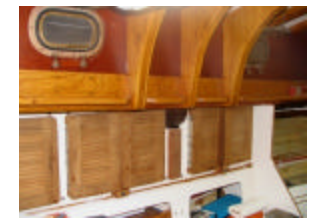
Main cabin port side