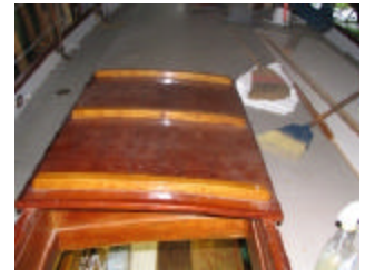
Deck towards bow