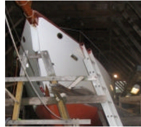
Bow of the boat