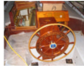
Helm and hatch