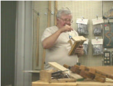
And a finger joint jig