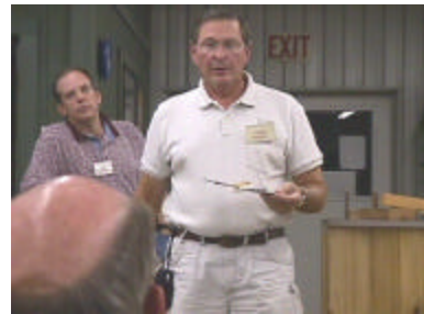
And an alignment jig for his table saw.