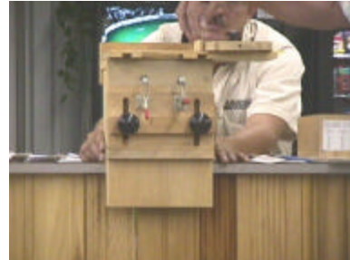
And a very adjustable mortise jig for his router