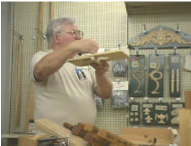
As well as a mortise jig for his router.