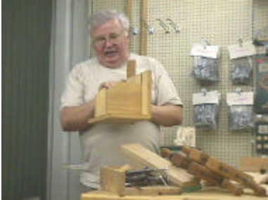
And a jig he uses to cut tenons for his table saw